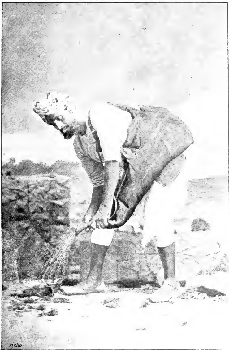
BHĪSTI, OR WATER CARRIER.